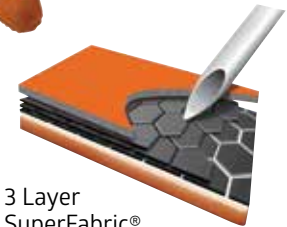
3 Layer SuperFabric®