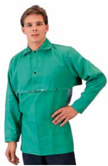
6221 & 6120